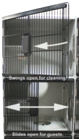
Sliding Grille Doors