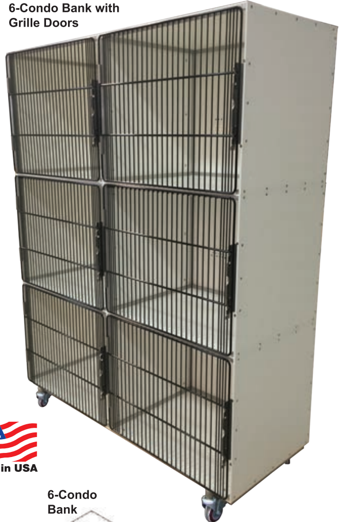
6-Condo Bank with Grille Doors

Banks of 6 or 9 condos on heavy-duty casters easily pass through a standard 7x3 ft. door